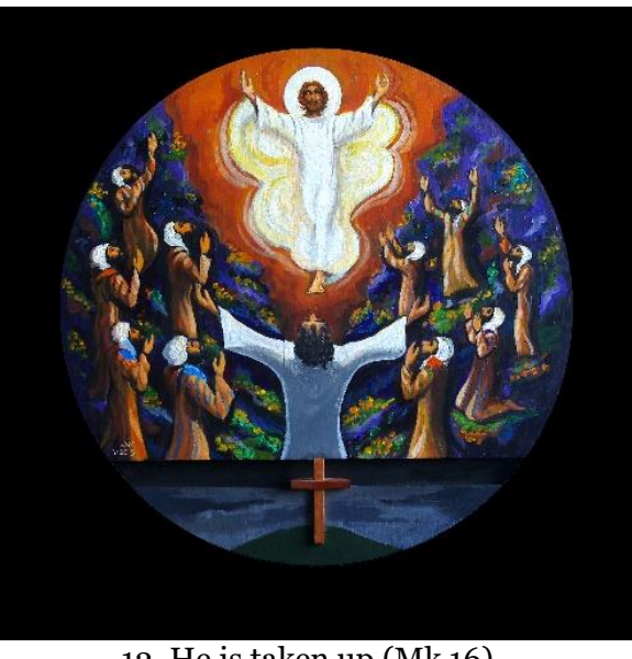
12. He is taken up (Mk 16)