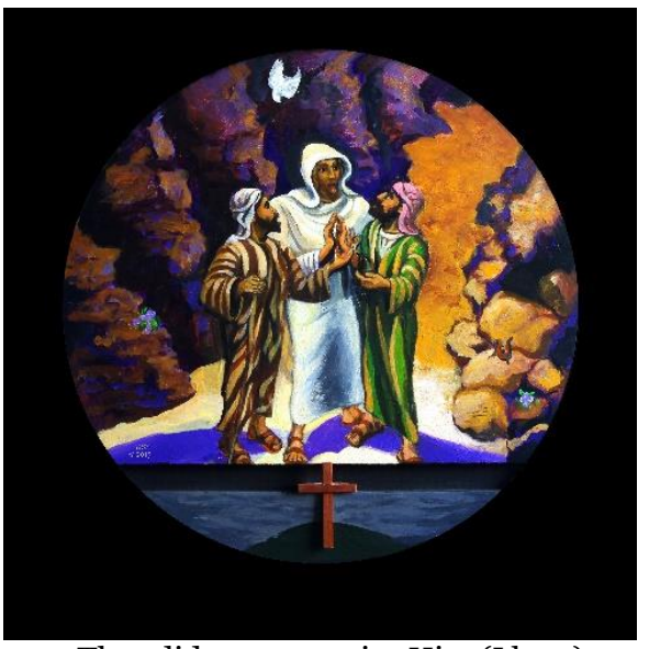
4. They did not recognize Him (Lk 24)