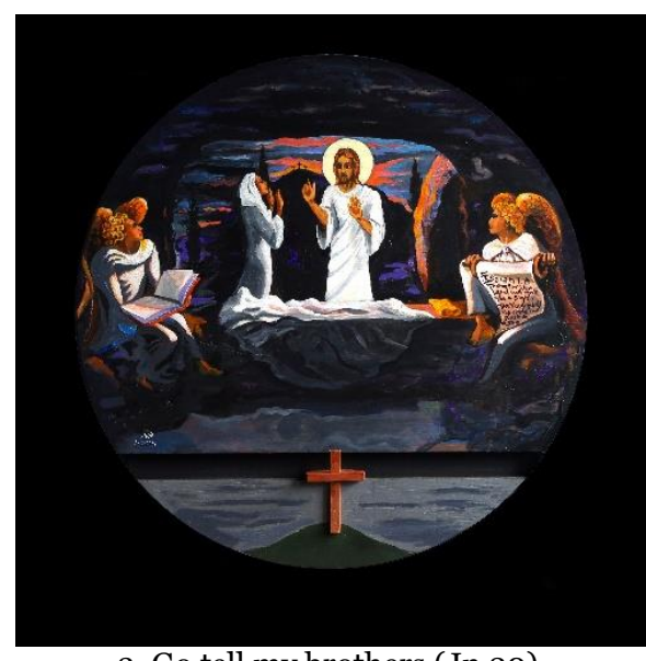
3. Go tell my brothers (Jn 20)