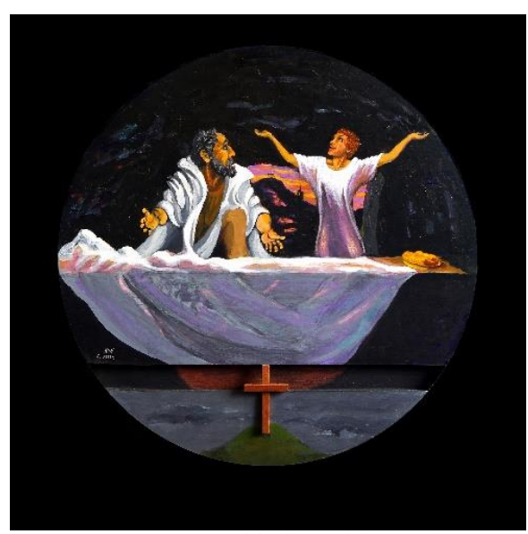
2. He saw and believed (Jn 20)