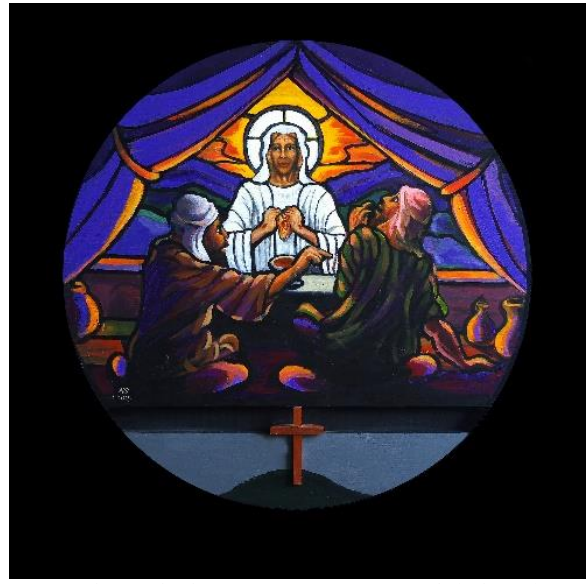
5. Then their eyes were opened (Lk 23)