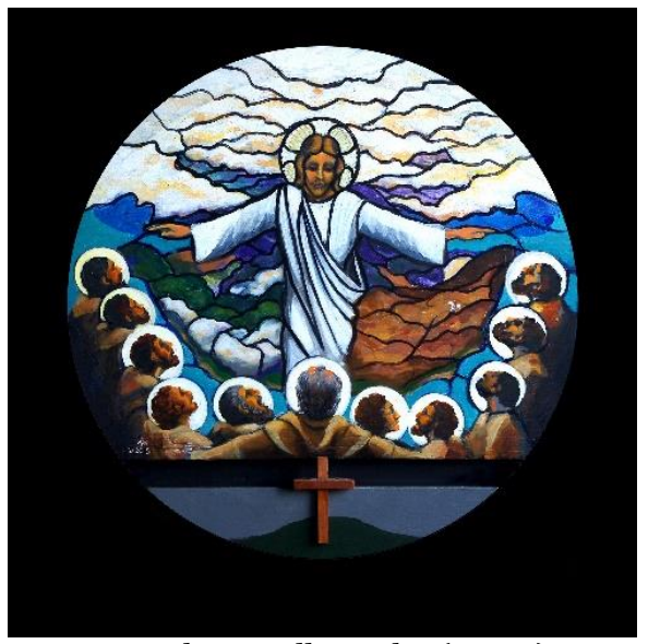
11. Go then to all Peoples (Mt 28)