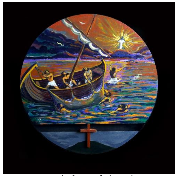
9. It is the Lord! (Jn 21)