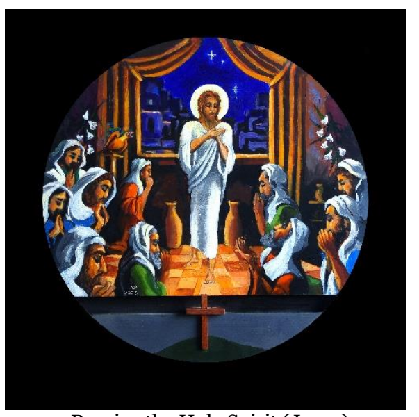
7. Receive the Holy Spirit (Jn 20)