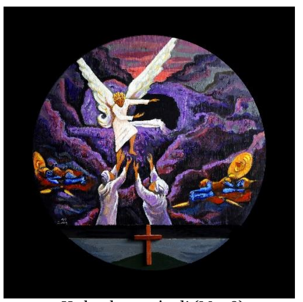
1. He has been raised! (Mt 28)