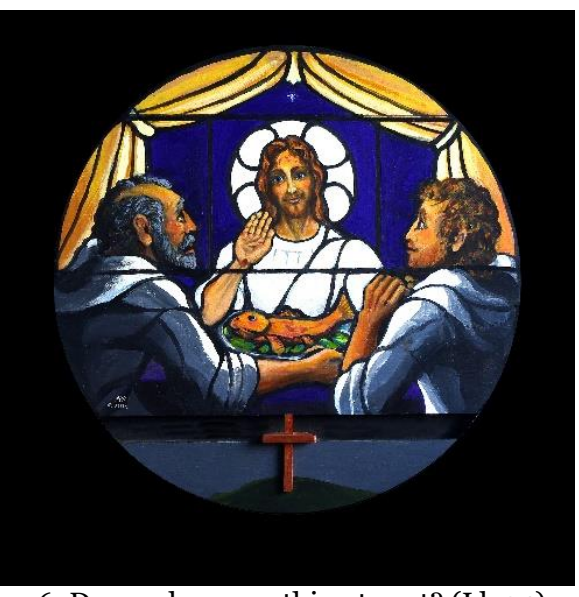
6. Do you have anything to eat? (Lk 24)