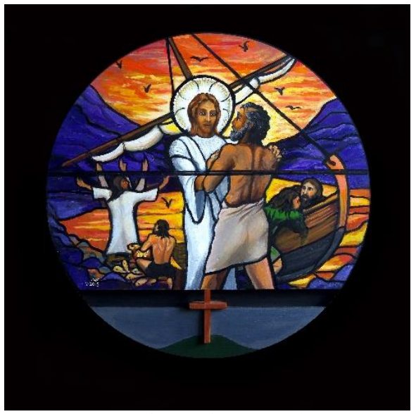
10. Peter, do you love me? (Jn 21)