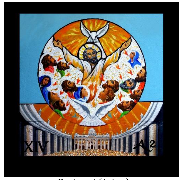
14. Pentecost (Acts 2)

The miracle of the Resurrection of our Lord and Savior Christ Jesus is the hope so desperately needed in our world today! To realize this Hope we need the FULL story of Salvation, which is incomplete without a deep understanding of the revealed truth of the Resurrection. My prayer is that we might see for ourselves, this miracle of miracles expressed through Sacred Art in the Church.