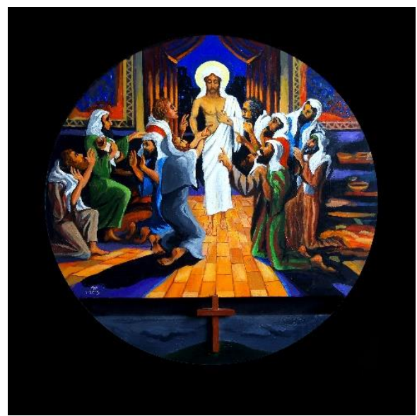
8. My Lord and my God! (Jn 20)